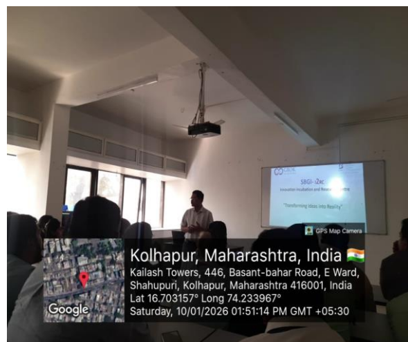
Visit to SIBIC Incubation Centre Kolhapur