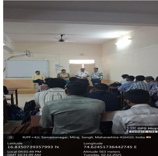
Guest interaction with students