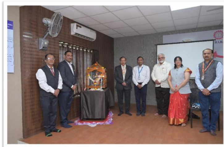
Inauguration of Avishkar Program by AAVISHKAR

Arranged Zonal Level Event “Avishkar 2026” on 15/11/2025